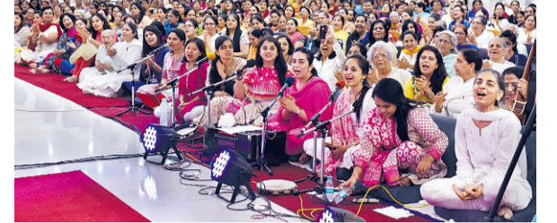
The launch was attended by a large number of people