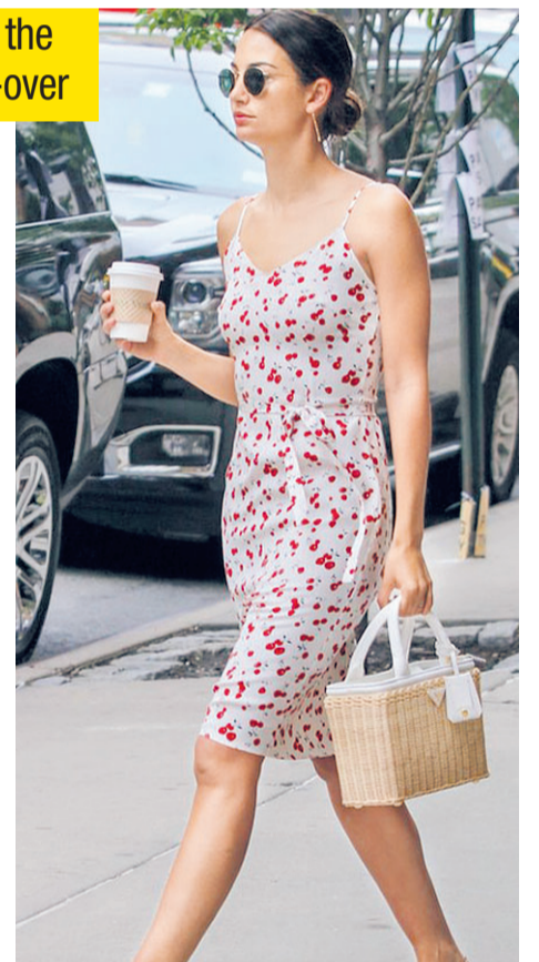
Lily Aldridge gives a girly spin to her raffia bag by wearing a cherry blossom dress

Straw bags have been given somewhat of a sleek make-over this season, and it seems they're not only for holidays, or carrying your beachy essentials. These trending bags are a big hit on the high street, and even celebs have been spotted with the must-have arm-candy too. Whether your bag be soft straw, rugged raffia or neatly woven and structured, there's a style to suit all tastes and summer occasions. Paired with a floral dress, palm print jumpsuit, or simply with a pair of embroidered jeans and cold shoulder tee, they're the perfect addition to any wardrobe. —Daily Mirror